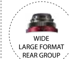
WIDE LARGE FORMAT REAR GROUP