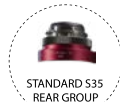
STANDARD S35 REAR GROUP