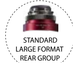
STANDARD LARGE FORMAT REAR GROUP