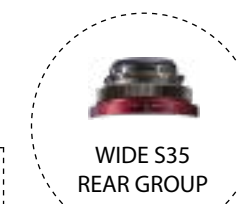
WIDE S35 REAR GROUP